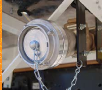
Standpipe Side Fill 65mm