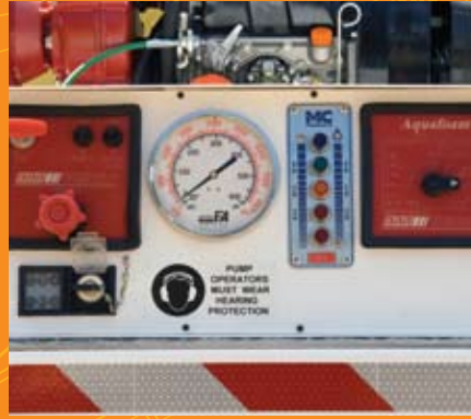
Fire Control Panel