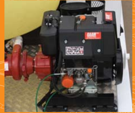
Ruggnerini Diesel Engine