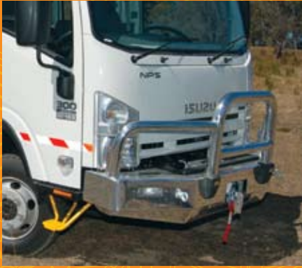
Bullbar and Winch